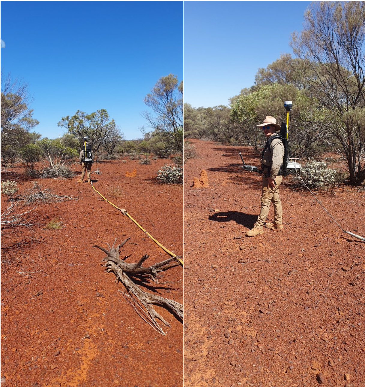
Figure 1: Bryah geologist collecting GPR data